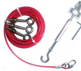
Tensioner / Gripper Assembly Allen Key 4mm Quick Link (QL) For up to 50m. spans ,one rope end is terminated with a thimble and permanent clamp. For over 50m. spans, 2 Tensioner / Gripper assemblies are supplied (no Quick Link).